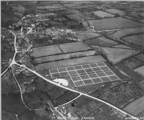
ST MER EGLISE, FRANCE.

9x9 Negatives rec'd from Personal Affairs Branch, Office Service Unit, 23 April 1946.