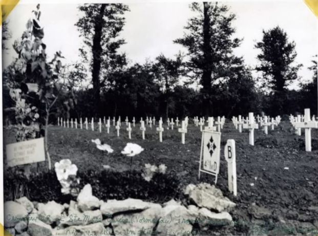
Cemetery of Ste. Marie Parish (Norman du) French New York, N.Y. on 11th St. - 1961