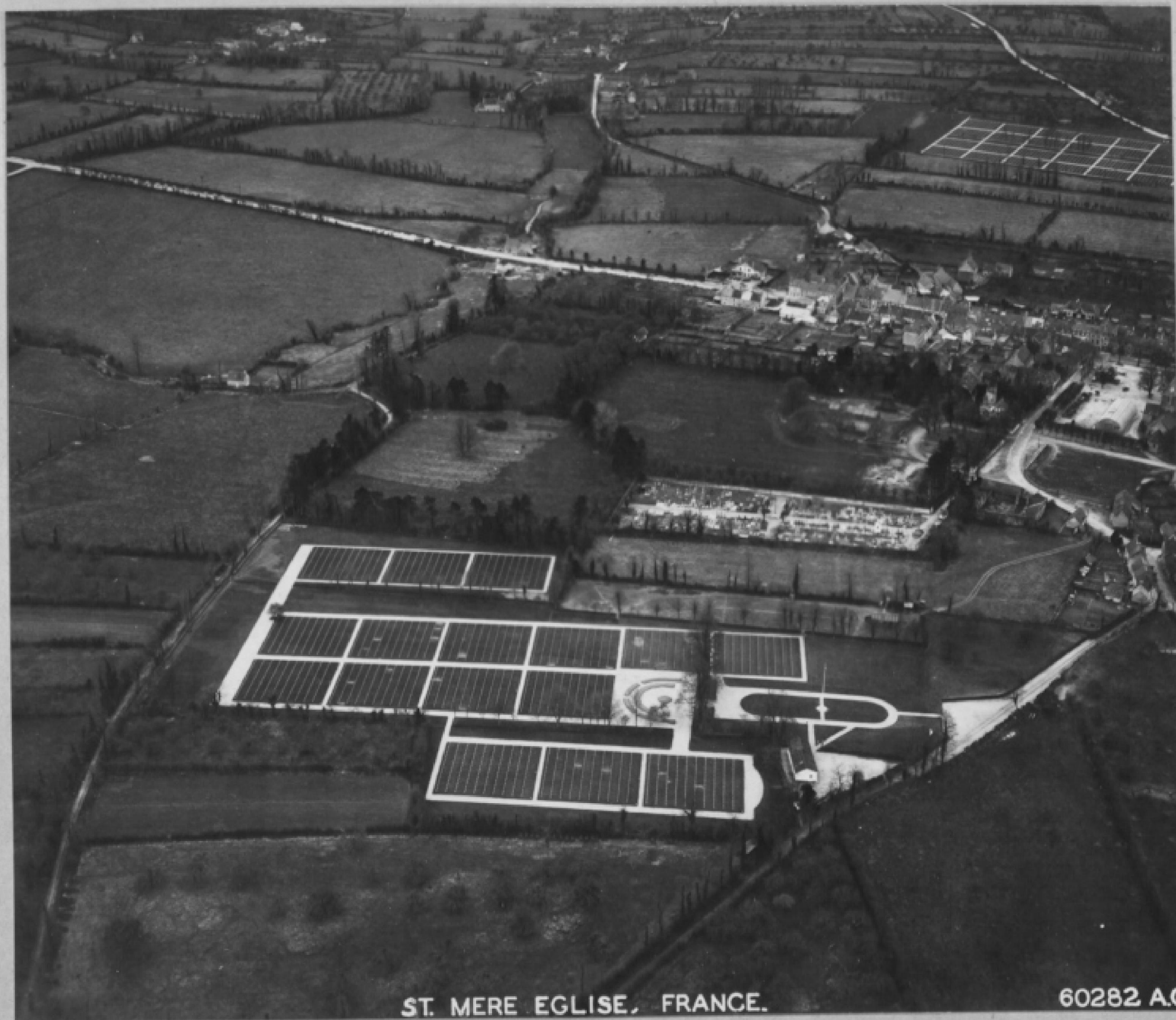
ST. MERE EGLISE, FRANCE.

9x9 Negatives rec'd from Personal Affairs Branch, Office Service Unit, 23 April 1946.