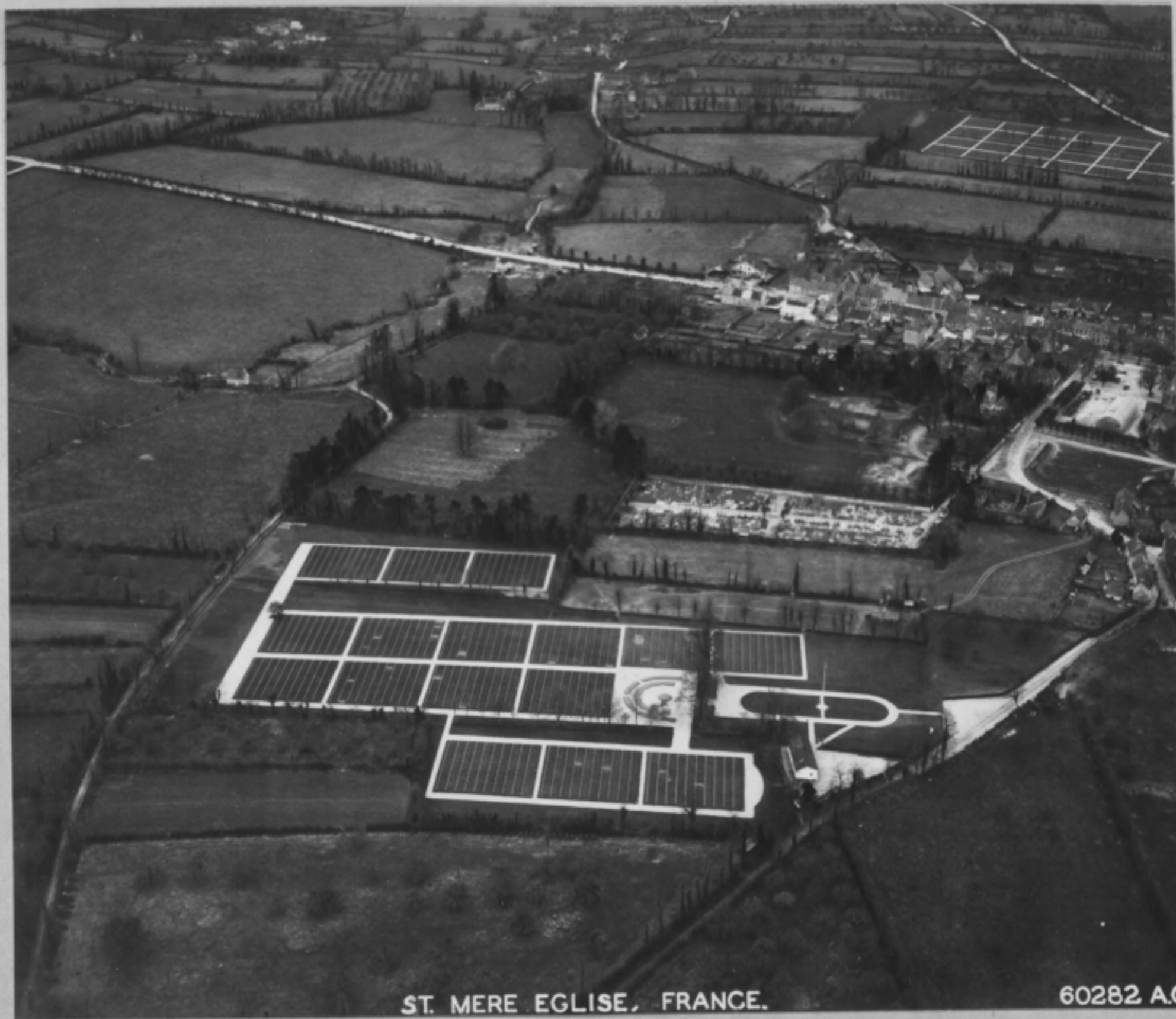
ST. MERE EGLISE, FRANCE.

9x9 Negatives rec'd from Personal Affairs Branch, Office Service Unit, 23 April 1946.