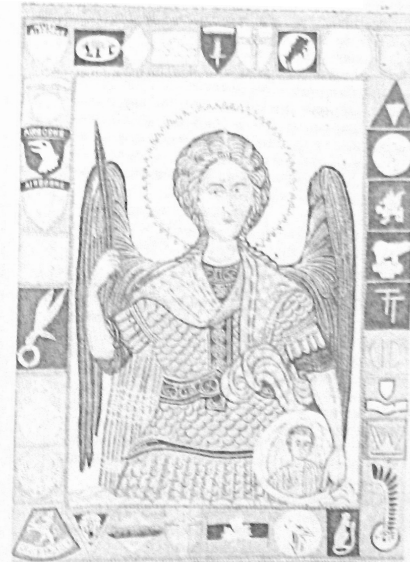
(St Michael; Macedonië, 16/17e eeuw)